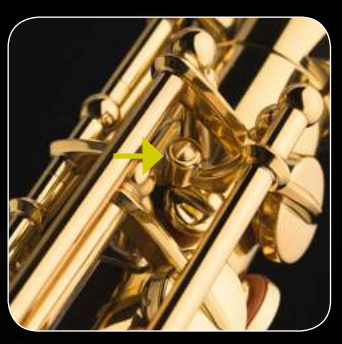
The adjustment screw for the body-octave key facilitates reliable middle A-tuning. (Pictured: alto saxophone)