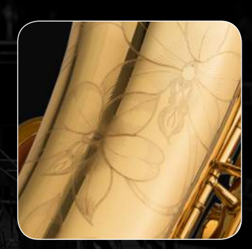
The elaborate engraving on the bell rounds out the 1100 Performance-series saxophones' irresistible look. (Pictured: alto saxophone)