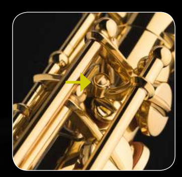
The adjustment screw for the body-octave key facilitates reliable middle A-tuning. (Pictured: alto saxophone)