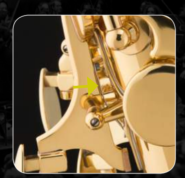
Phosphor-bronze flat springs ensure a perfectly smooth key response. (Pictured: alto saxophone)