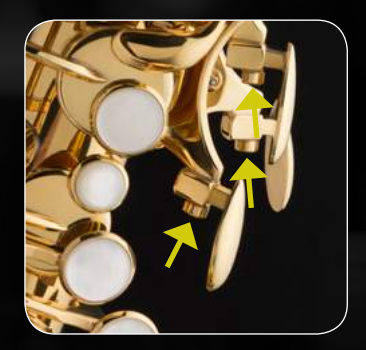
The adjustable palm keys can be tailored to the size of the player's hands, providing maximum comfort. (Pictured: alto saxophone)