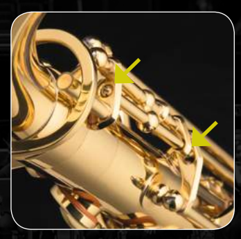
The adjustable octave mechanism allows you to fine-tune the octave response, while avoiding slack and affording effortless transitions from the high to the low registers. (Pictured: alto saxophone)