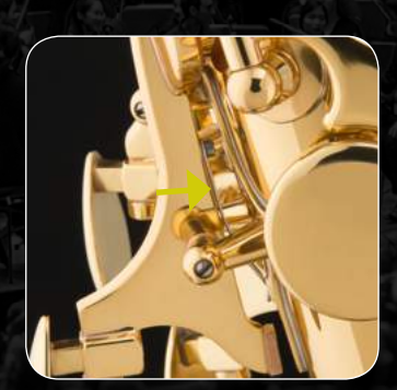
Phosphor-bronze flat springs ensure a perfectly smooth key response.