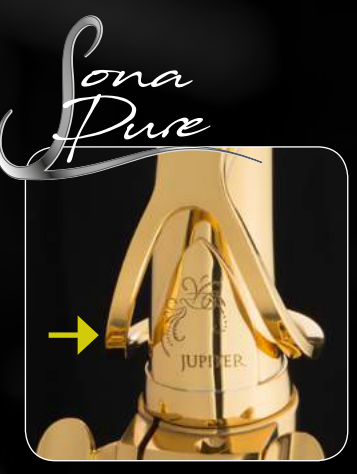
A specially developed temperature treatment and the engraved resonance guard provide the hydraulically drawn Sona-Pure Neck—and indeed the entire instrument—with a uniquely big sound.