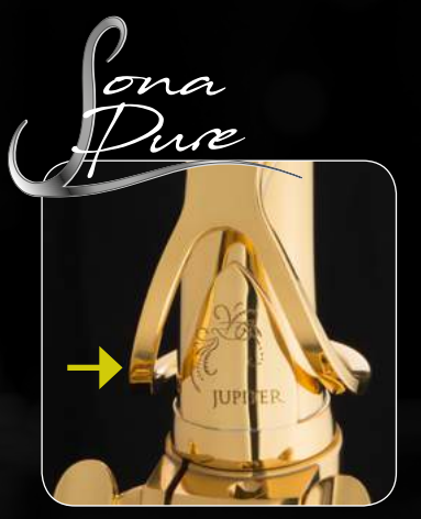
A specially developed temperature treatment and the engraved resonance guard provide the hydraulically drawn Sona-Pure Neck—and indeed the entire instrument—with a uniquely big sound.