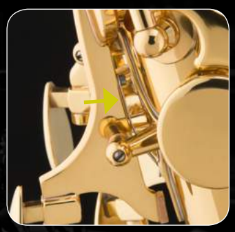
Phosphor-bronze flat springs ensure a perfectly smooth key response. (Pictured: alto saxophone)