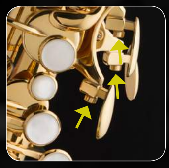
The adjustable palm keys can be tailored to the size of the player's hands, providing maximum comfort. (Pictured: alto saxophone)