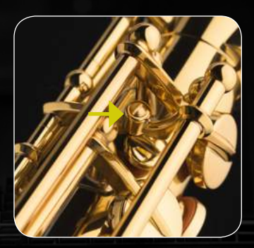
The adjustment screw for the body-octave key facilitates reliable middle A-tuning. (Pictured: alto saxophone)