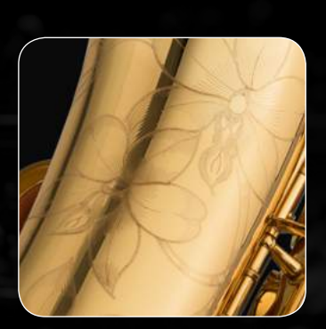
The elaborate engraving on the bell rounds out the 1100 Performance Series Saxophones' irresistible look. (Pictured: alto saxophone)