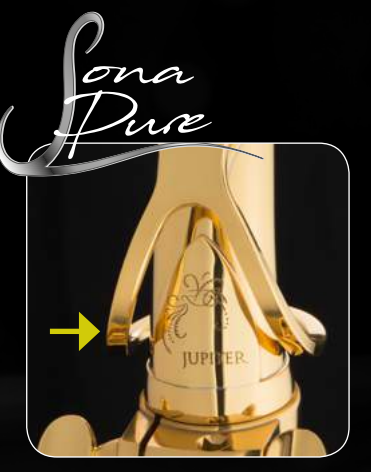
A specially developed temperature treatment and the engraved resonance guard provide the hydraulically drawn Sona-Pure Neck—and indeed the entire instrument—with a uniquely big sound. (Pictured: alto saxophone)