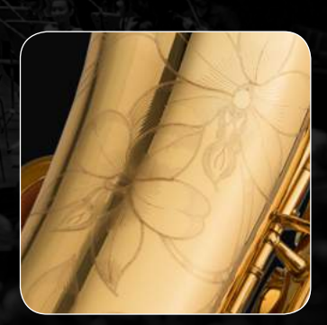
The elaborate engraving on the bell rounds out the 1100 Performance-series saxophones' irresistible look.