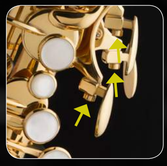
The adjustable palm keys can be tailored to the size of the player's hands, providing maximum comfort.