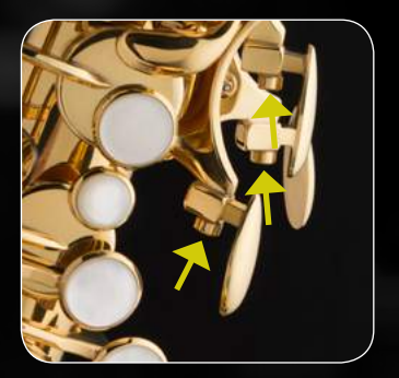
The adjustable palm keys can be tailored to the size of the player's hands, providing maximum comfort. (Pictured: alto saxophone)