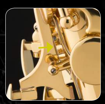
Phosphor-bronze flat springs ensure a perfectly smooth key response. (Pictured: alto saxophone)