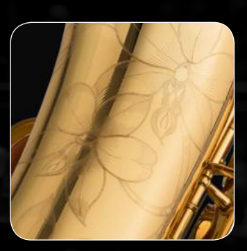
The elaborate engraving on the bell rounds out the 1100 Performance-series saxophones' irresistible look.