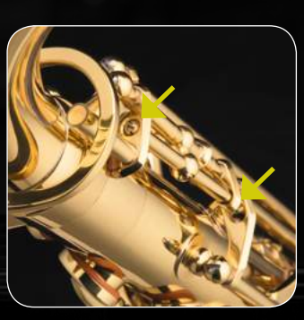
The adjustable octave mechanism allows you to fine-tune the octave response, while avoiding slack and affording effortless transitions from the high to the low registers.