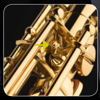
The adjustment screw for the body-octave key facilitates reliable middle A-tuning.